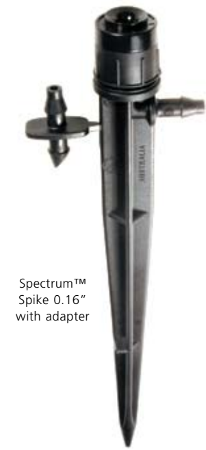
Spectrum™ Spike 0.16" with adapter