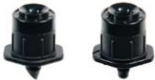
Spectrum™ Barb 0.16"