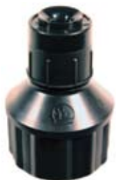
Spectrum™ Thread 1/2"